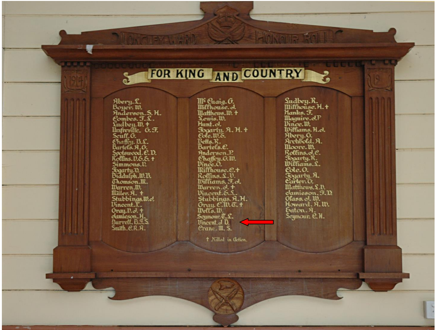
Longley Ward Honour Roll