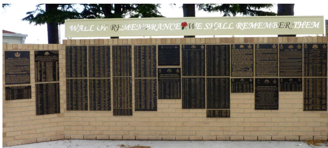
Wall of Remembrance, St. Helens, Tasmania

"What these men did nothing can alter now. The good and the bad, the greatness and the smallness of their story will stand. Whatever of glory it contains nothing now can lessen. It rises, as it will always rise, above the mists of ages, a monument to great hearted men; and for their nation, a possession forever."