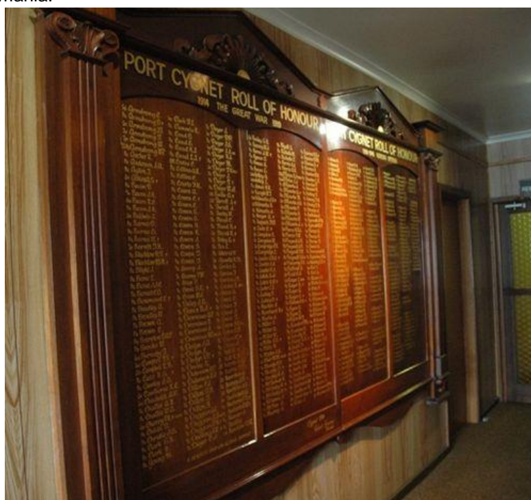
Port Cygnet Roll of Honour